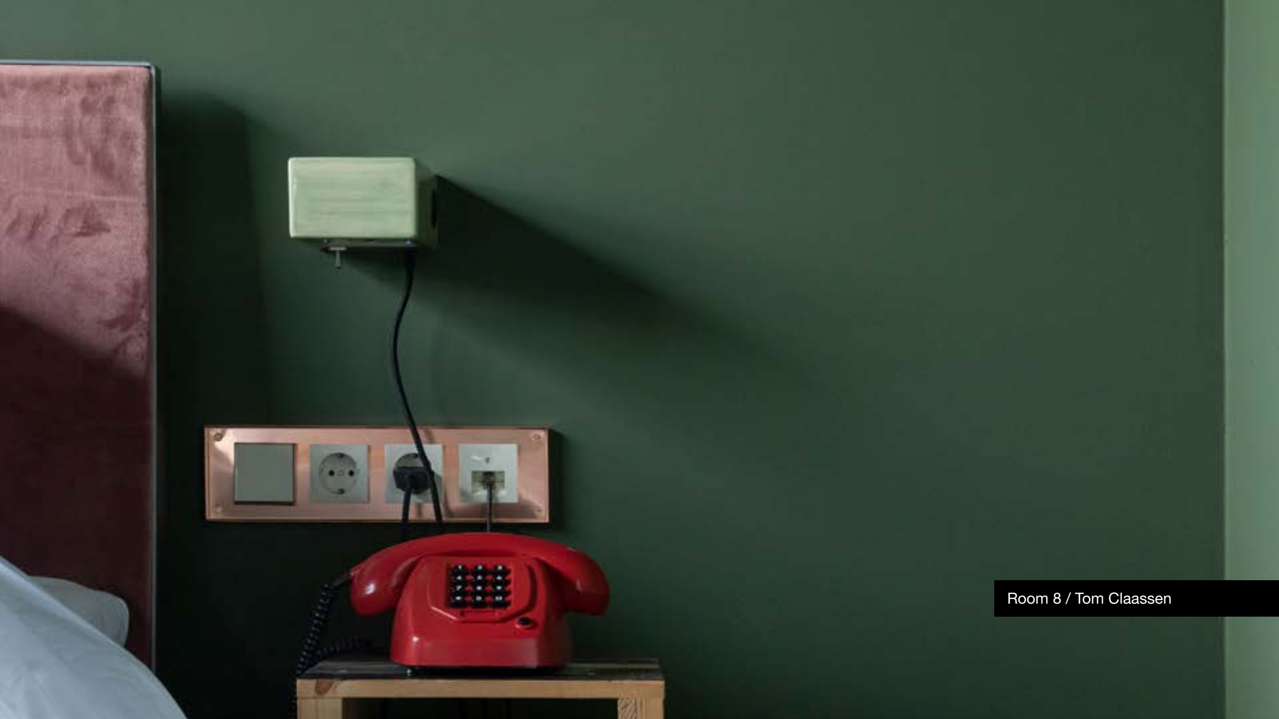
Room 8 / Tom Claassen