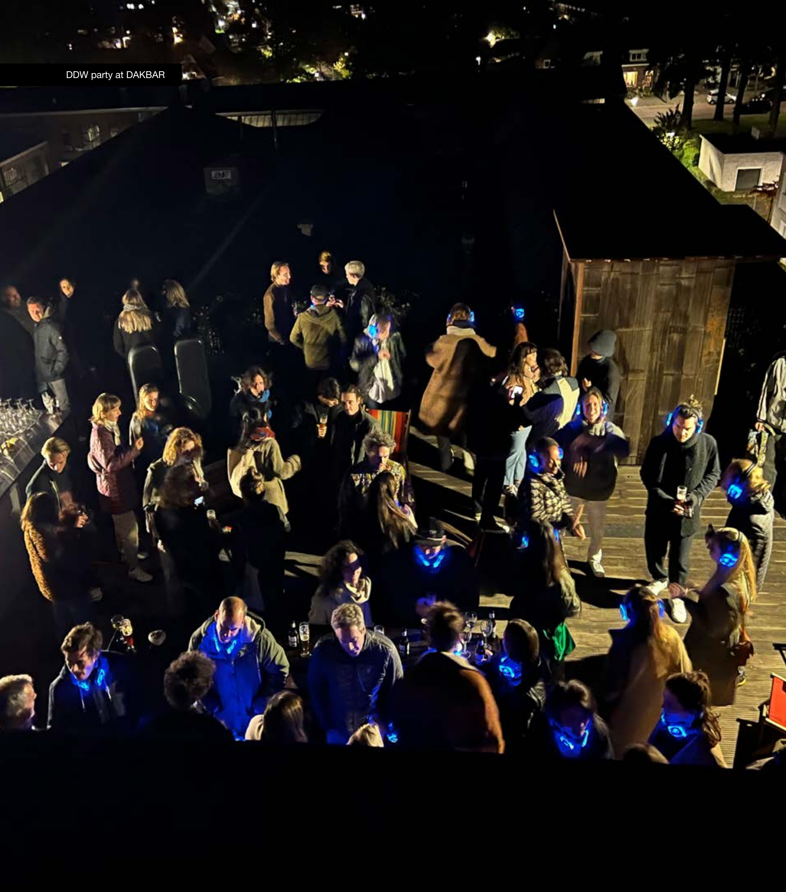
DDW party at DAKBAR