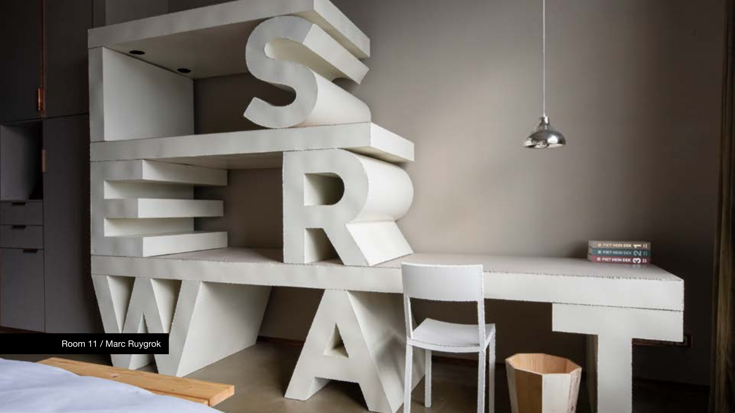
Room 11 / Marc Ruygrok