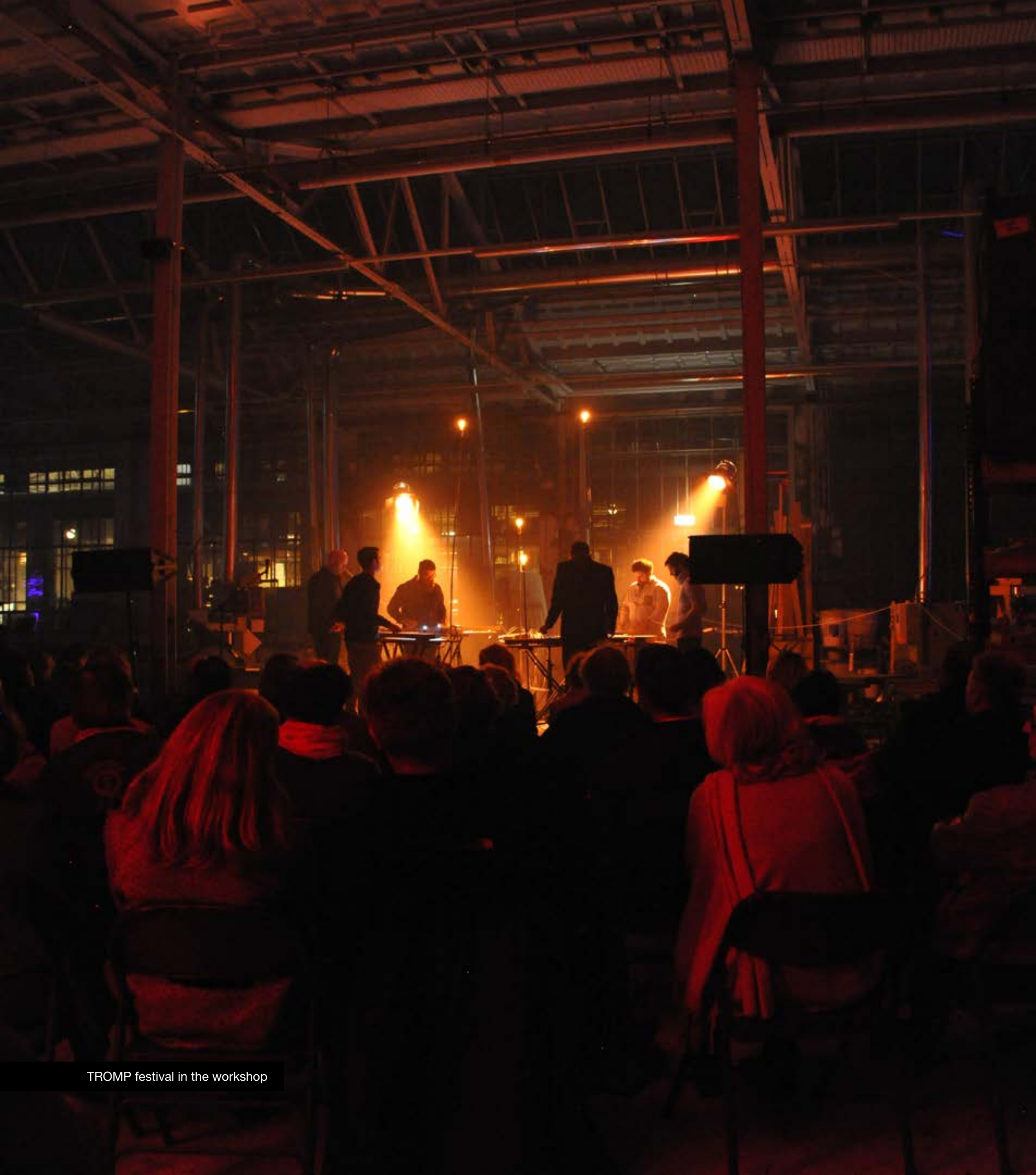
TROMP festival in the workshop