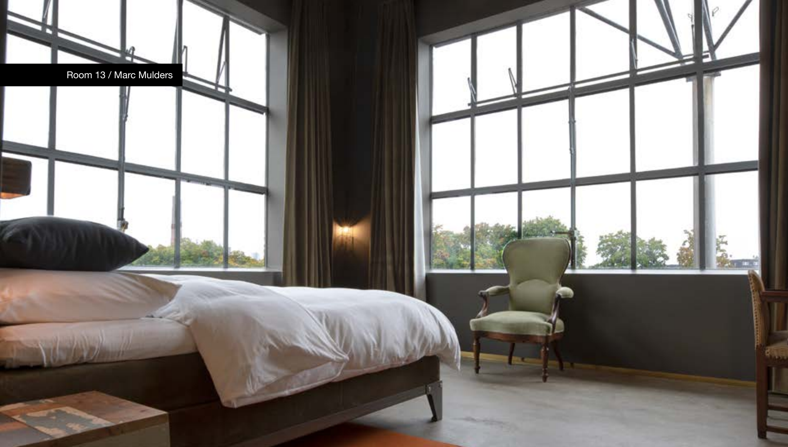
Room 13 / Marc Mulders