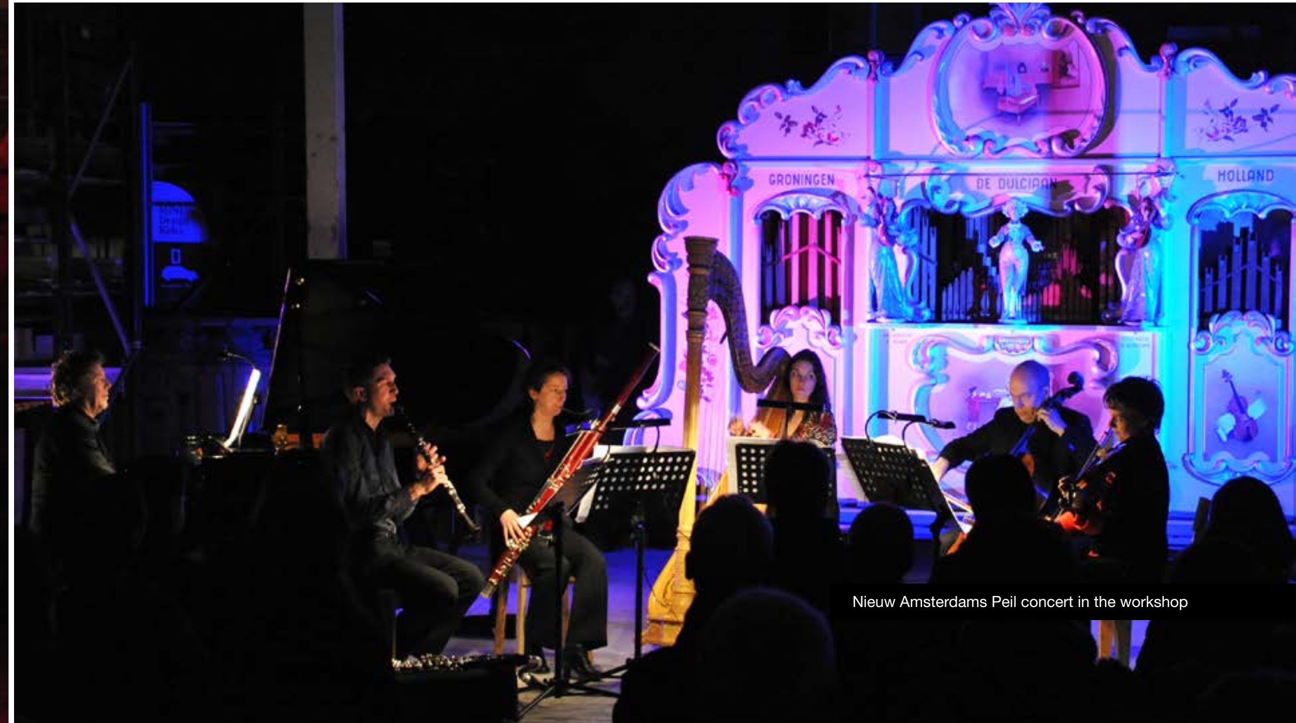
Nieuw Amsterdams Peil concert in the workshop