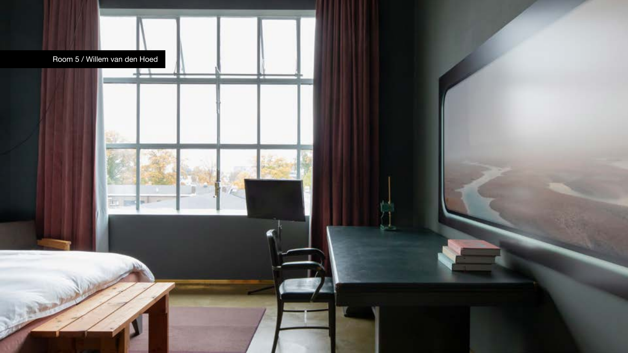
Room 5 / Willem van den Hoed