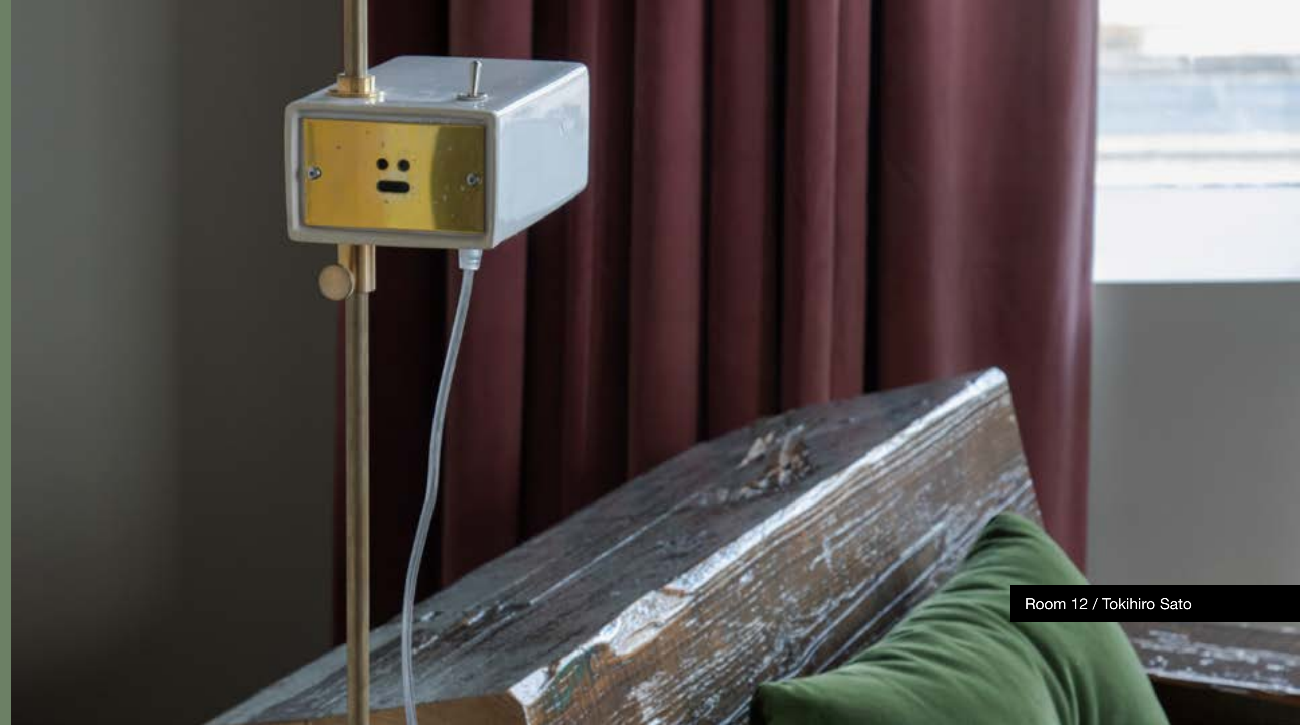
Room 12 / Tokihiro Sato